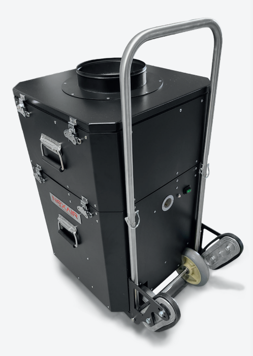
Easy to carry with inclined stair climber kit.